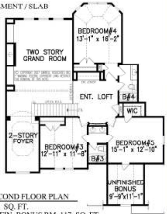
SECOND FLOOR PLAN 951 SQ. FT. UNFIN. BONUS RM. 117 SQ. FT.